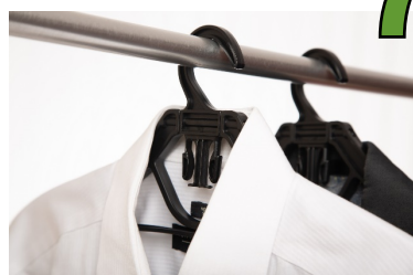
Rotating Hangers in Closet