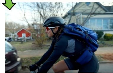
Bike to Work with a Crease Free Wardrobe