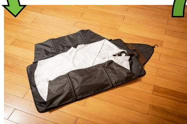
Clip Into the Garment Sleeve