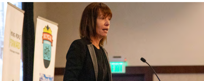
Janette Sadik-Khan gives her keynote address.

On February 7 we hosted our third-annual Moving People Forward conference, dedicated to discussing and improving mobility across the state. This year's program was highlighted by Janette Sadik-Khan's keynote address—Streetfight: Handbook for an Urban Revolution. Her address dove into the many ambitious projects she tackled while serving as transportation commissioner in New York City, the support she received from former Mayor Michael Bloomberg's administration, the role that advocates play in changing a community, what we're doing right in Colorado, and where we could still improve.